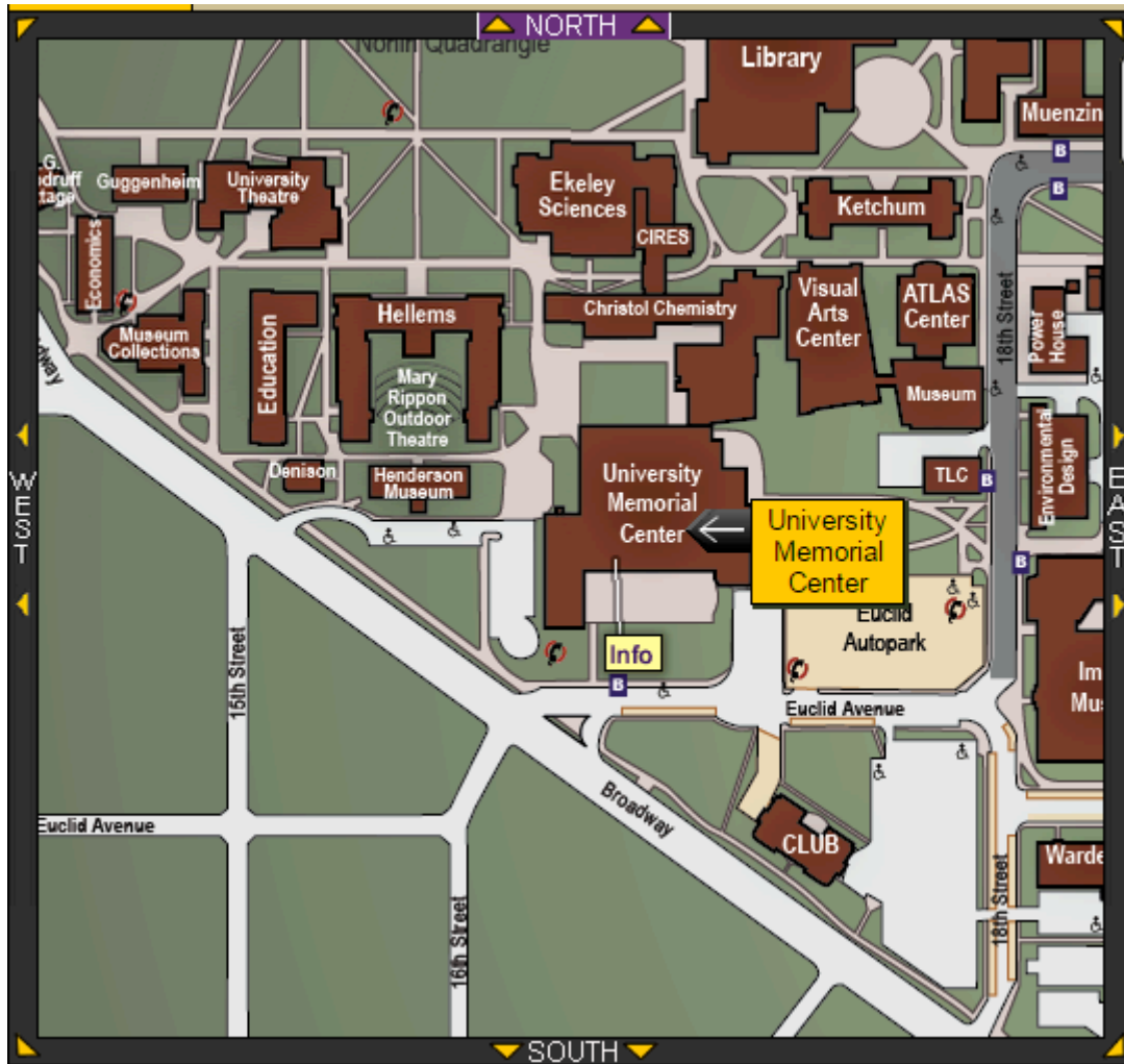
Detail map of the UMC.

The joint meeting of the CryoNet, Portal and Website & Outreach Teams will begin on 7 December 2015, at 09:00 hours and will end at 9 December 2015 at 17:00 h. The GCW SG meeting will begin on 10 December at 09:00 h and will end on the 11 December 2015 at 17:00 h.